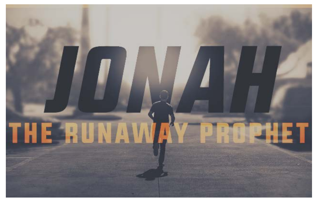
Sunday, April 2, 2023